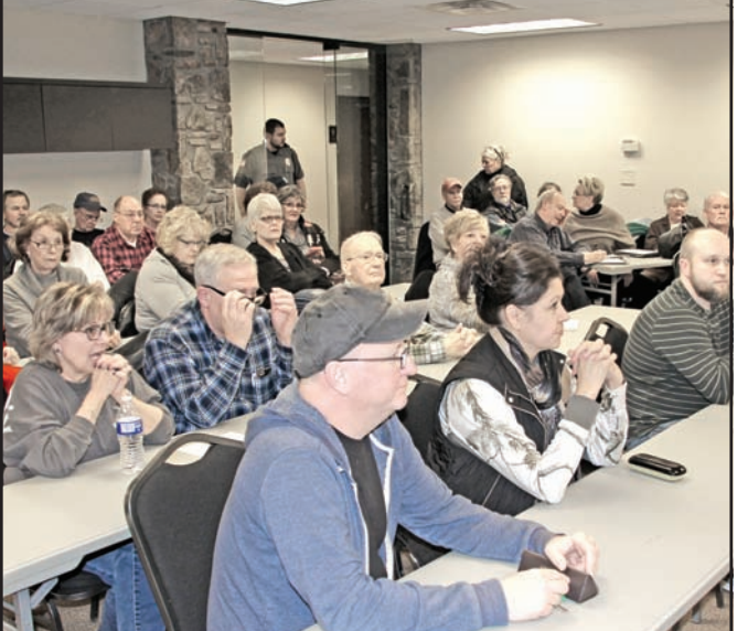
More than 50 people attended the ordinance public hearing at Hiawassee City Hall on Thursday, Jan. 26.